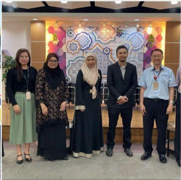
Research collaboration activities