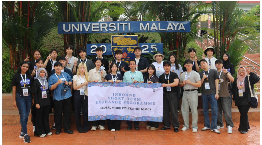
In front of the iconic “UNIVERSITI MALAYA”

This initiative reflects FCSIT's continued commitment to nurturing global tech talents and enhancing international collaboration in the field of emerging technologies. The AESEP is not only a platform for academic growth but also a step forward in cultivating a new generation of responsible and innovative AI practitioners.