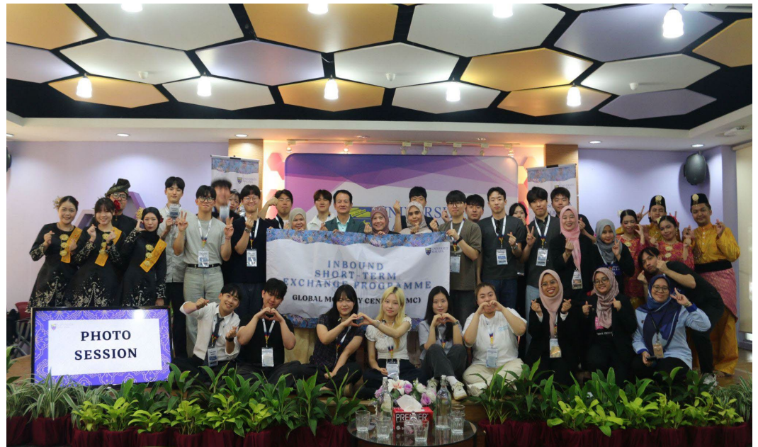
Photo Session with students from INHA Technical College, Korea

AI & Data Excellence Summer Enrichment Programme (AESEP), Faculty of Computer Science and Information Technology, UM