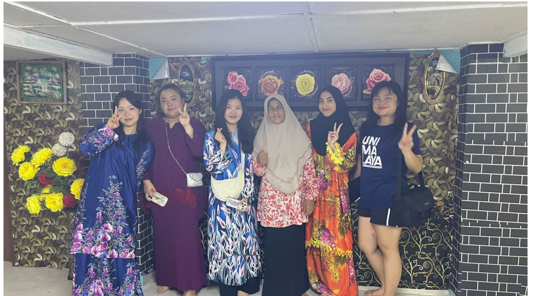
The Students dressed in traditional Malay attire

As FCSIT continues to drive innovation and collaboration through programmes like AESEP, Universiti Malaya remains steadfast in its mission to nurture future-ready, globally competent digital leaders. This initiative not only strengthens academic networks but also lays the foundation for deeper international partnerships in the years to come.